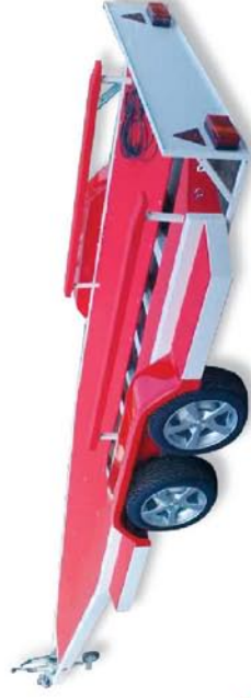
RM1095 GB Watersports

2 Southview Road, Walton, Peterborough, Cambridgeshire, PE4 6AG ENGLAND