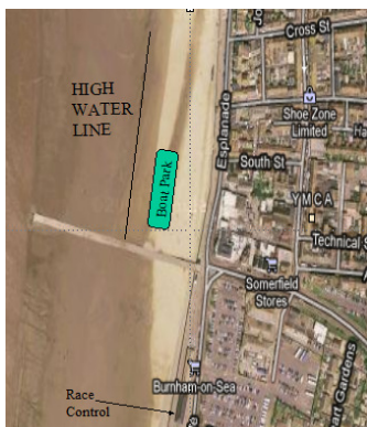
Map of boat park and race control

At the top of the road is the RNLI Station and Morrisons (on map it says somerfield), turn left at the traffic lights and the camper zone is to the left as you enter the car park.